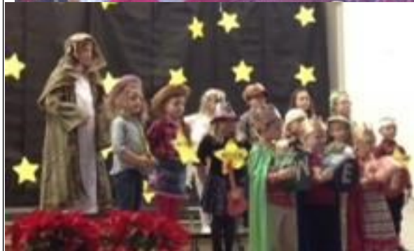
On Sunday afternoon our children shared the story of Christmas through music and a wonderful play, Star of Wonder . It

was a marvelous night! Thank you to everyone who attended and participated.